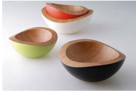
Figure 3: Bamboo products produced by pressing technology