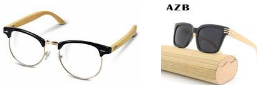
Figure 5: The glasses with bamboo

If the product is designed with a single material, the visual effect of the product will be greatly