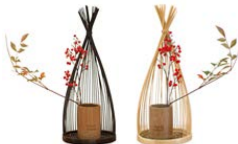
Figure 1: Bamboo products designed by Nature House

Figure 1 shows the ponytail bamboo vase flower room flower decoration and the tea ceremony Zen bamboo flower arrangement designed by the "Nature House". In this product, the designer uses the traditional craftsmanship, but uses modern styling methods in the shape of the product to make the product simple and clear, and visually highly ornamental [3].